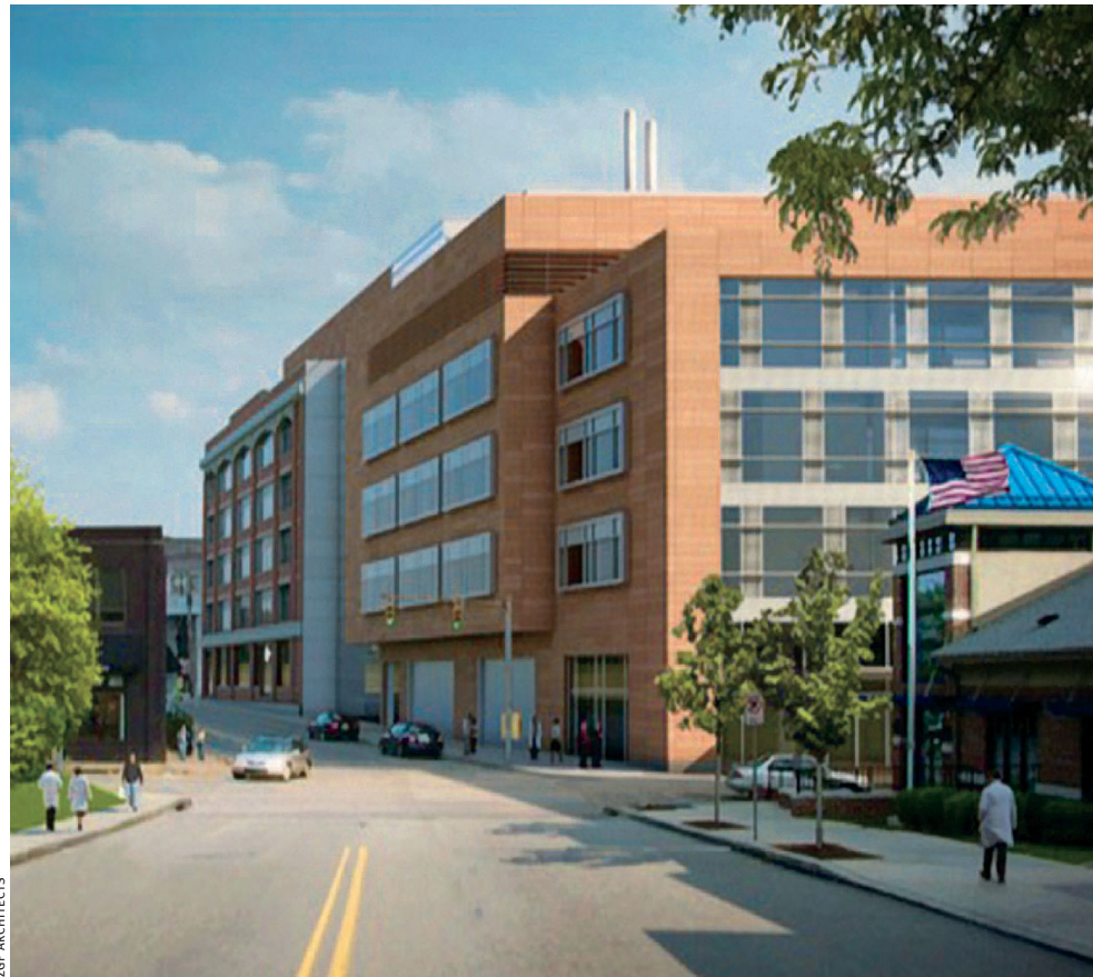
A rendering of the UPMC Center for Innovative Science, at a proposed site in Shadyside.