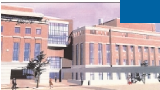
UPCI at Shadyside