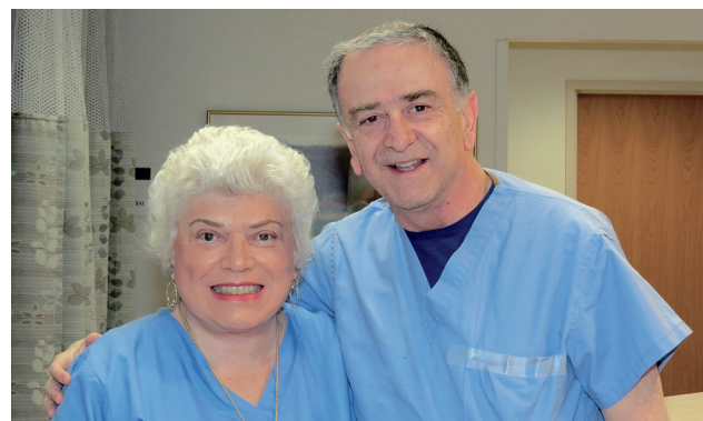
MAGEE-WOMENS RESEARCH INSTITUTE AND FOUNDATION