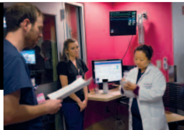
Rounds at Children's include nurses, nurse practitioners, respiratory therapists, pharmacists, social workers, residents, fellows, and attendings. Family members also attend rounds.