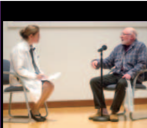
Getting all six Schools of the Health Sciences together at once can be tough. The annual Interprofessional Forum, is one way Pitt gathers everyone together in their first year of classes to learn from one another.